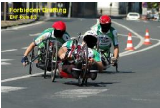
Two H5 riders behind one H3 rider (H5 riders are also wearing a wrong helmet colour)