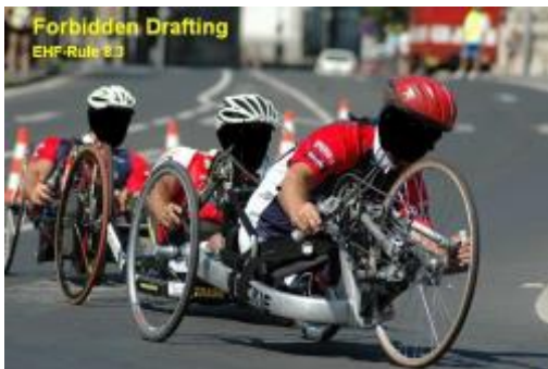
Two H3 riders directly behind one H5 rider